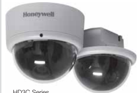
HD3C Series shown with mount ring for surface mount